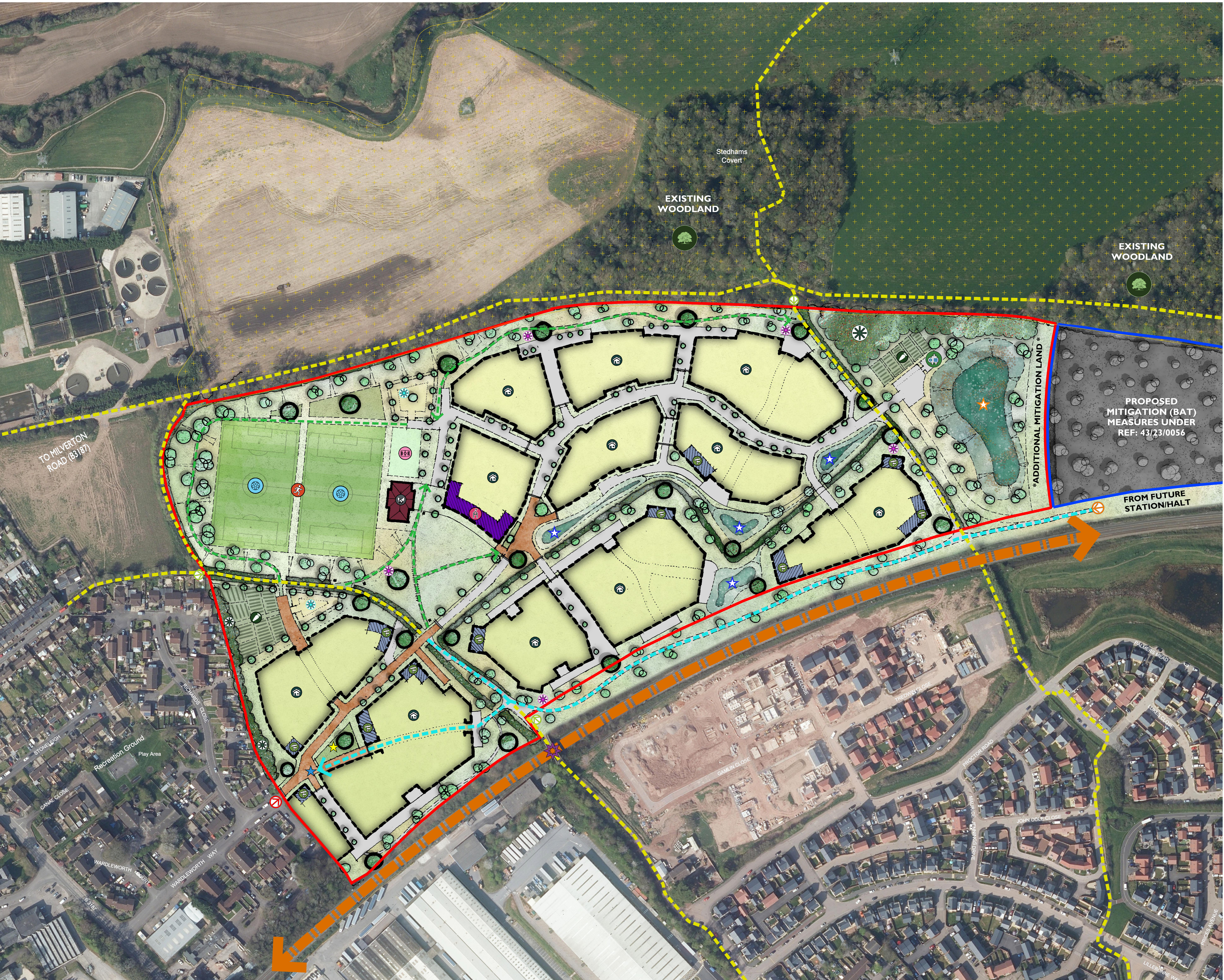
LAND OFF WARDLEWORTH WAY, TONEDALE, WELLINGTON ILLUSTRATIVE MASTERPLAN

DATE : OCTOBER 2024 DRAWING TITLE : ILLUSTRATIVE MASTERPLAN DRAWN : CM DRAWING NO : 0810-1005